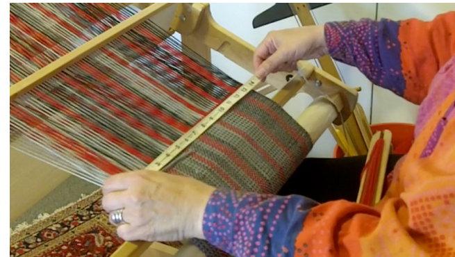
Figure 3 A collaborating crafter working at home

In a second step, students engaged in the chosen craft form. If the first analysis was a purely technological breakdown of the process, then this second step was the experiential exploration of what it feels like to weave, knit, bake, craft. Finally, we designed digital components to transform the existent practice. Over the course of the next weeks, prototypes were built and presented to the crafters for initial feedback.