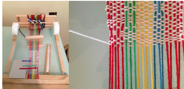
Figure 4 Student built proof-of-concept weaving loom and abstracted irregular patterns driven by image analysis

The close collaboration with a crafter/ artists quickly made it clear that in the actual craft practice production of an object is important but far from the only desired goal. Instead, the personal experience of the process, the personal motivation for each craftsperson, and their individual gain from the process were also relevant. One example was the collaboration with a weaver, who was also interested in bird watching. Instead of dividing these interests into two different fields, the digital intervention on her weaving practice became a proof-of-concept-prototype that controlled weaving patterns procedurally informed by an image analysis of bird photographs. Since the Jacquard loom, weaving has been controlled by some form or mechanical or digital pattern. However, in this instance the procedural patterns were driven by an image analysis of this weaver's own interest in wildlife photographs and the project became highly personal.